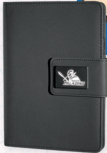
32472 SCX Design® Notebook A5 with Power Bank 4000 mAh Min. 10, Was $80.20(C)