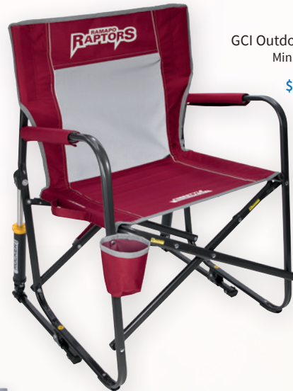
26279 GCI Outdoor™ Freestyle Rocker™ Min. 6, Was $182.07(E)