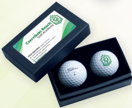
60760 Titleist® 2-Ball Business Card Box - Pro V1® Min. 72, Was $23.04(C)