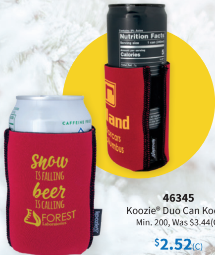
46345 Koozie® Duo Can Cooler Min. 200, Was $3.44(C)