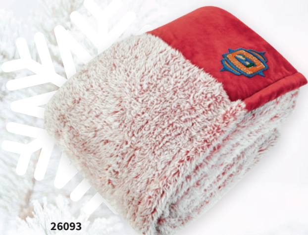
26093 Super-Soft Plush Blanket Min. 20, Was $54.16(C)