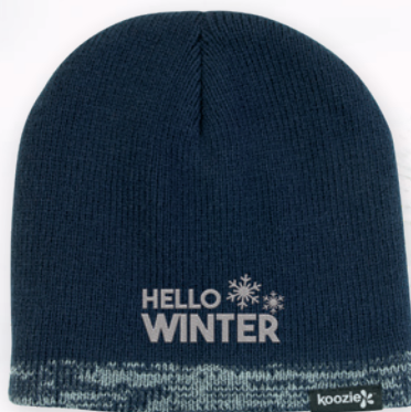
26120 Koozie® Two-Tone Beanie Min. 48, Was $15.05(C)