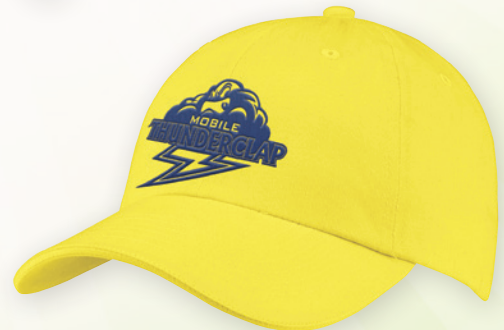
45413 Front Runner Cap Min. 48, Was $7.22(C)