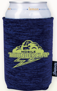
46423 Koozie® Heather Collapsible Can Cooler Min. 250, Was $2.29(C)