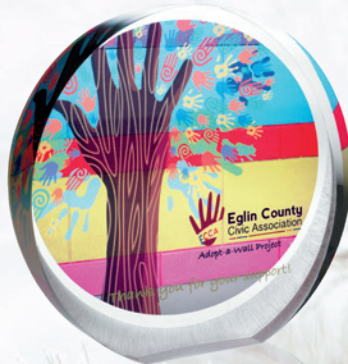
36692 JAFFA® Radiant Orbit Award - Medium Min. 6, Was $86.52(C)