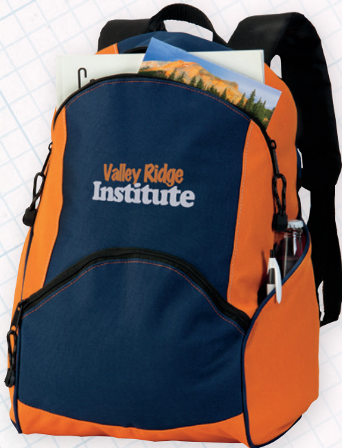
AP5040 Atchison® On the Move Backpack Min. 50, Was $15.51(C)