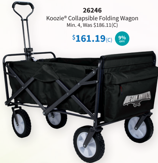
26246 Koozie® Collapsible Folding Wagon Min. 4, Was $186.11(C)