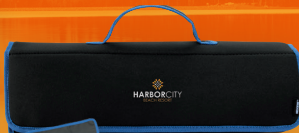
26123 | Koozie® Kamp 5-piece BBQ Set