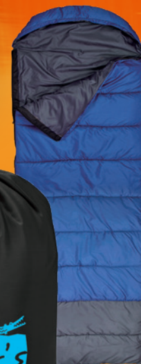
26125 | Koozie® Kamp 20° Sleeping Bag

Koozie® is a registered trademark of Koozie Group.