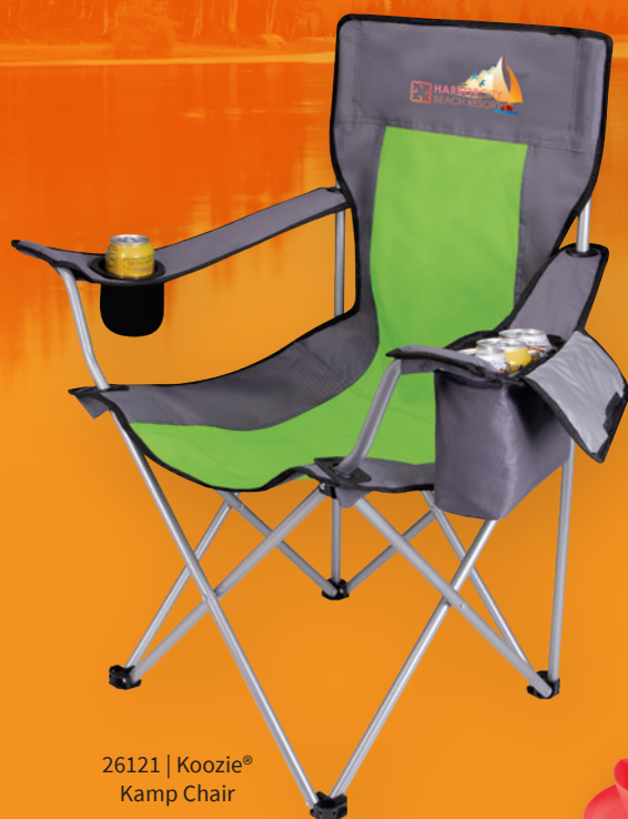
26121 | Koozie® Kamp Chair

check out our collection of koozie ™ outdoor gear at kooziegroup.com