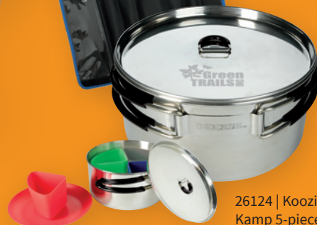
26124 | Koozie® Kamp 5-piece BBQ Set